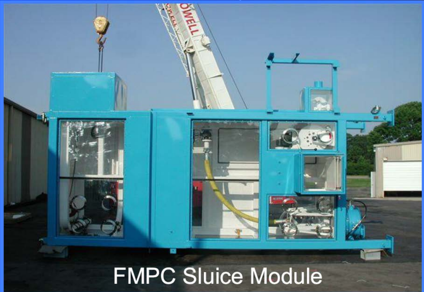
FMPC Sluice Module