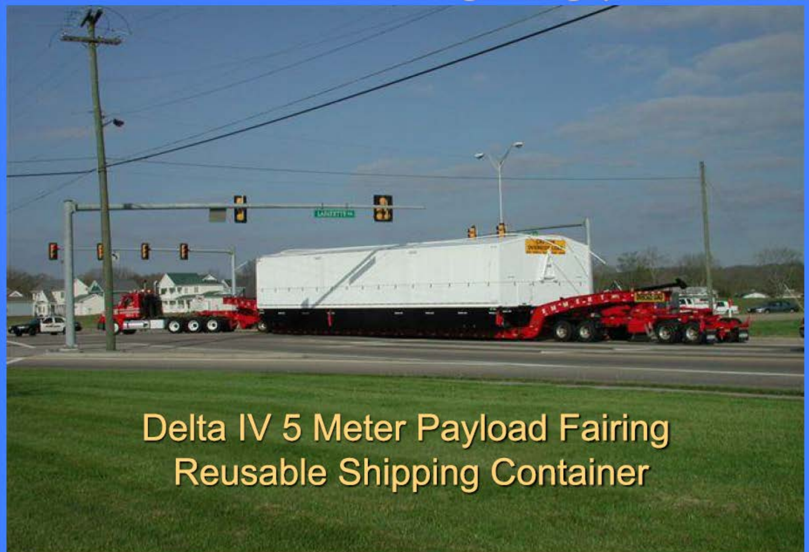
Delta IV 5 Meter Payload Fairing Reusable Shipping Container