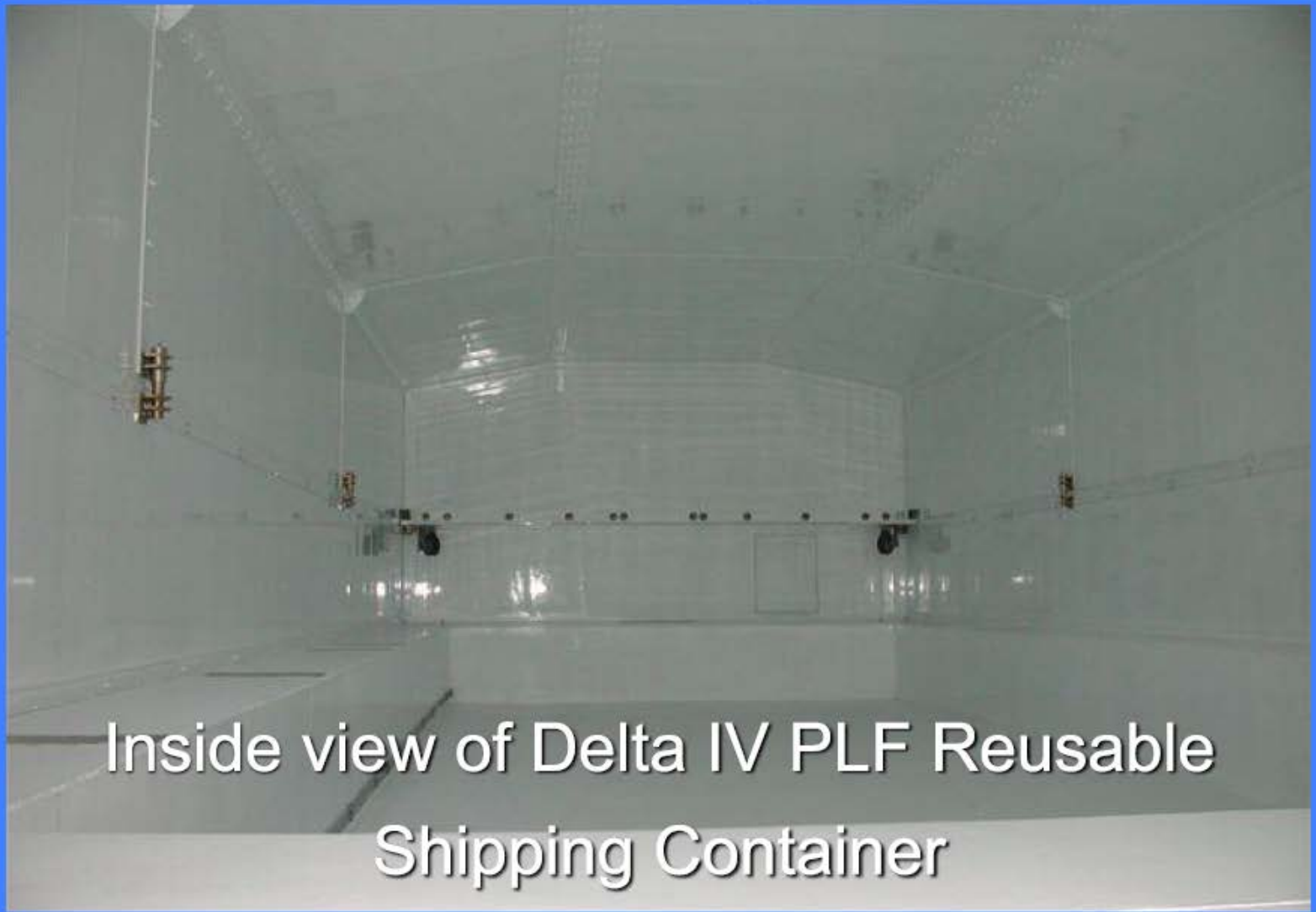
Inside view of Delta IV PLF Reusable Shipping Container